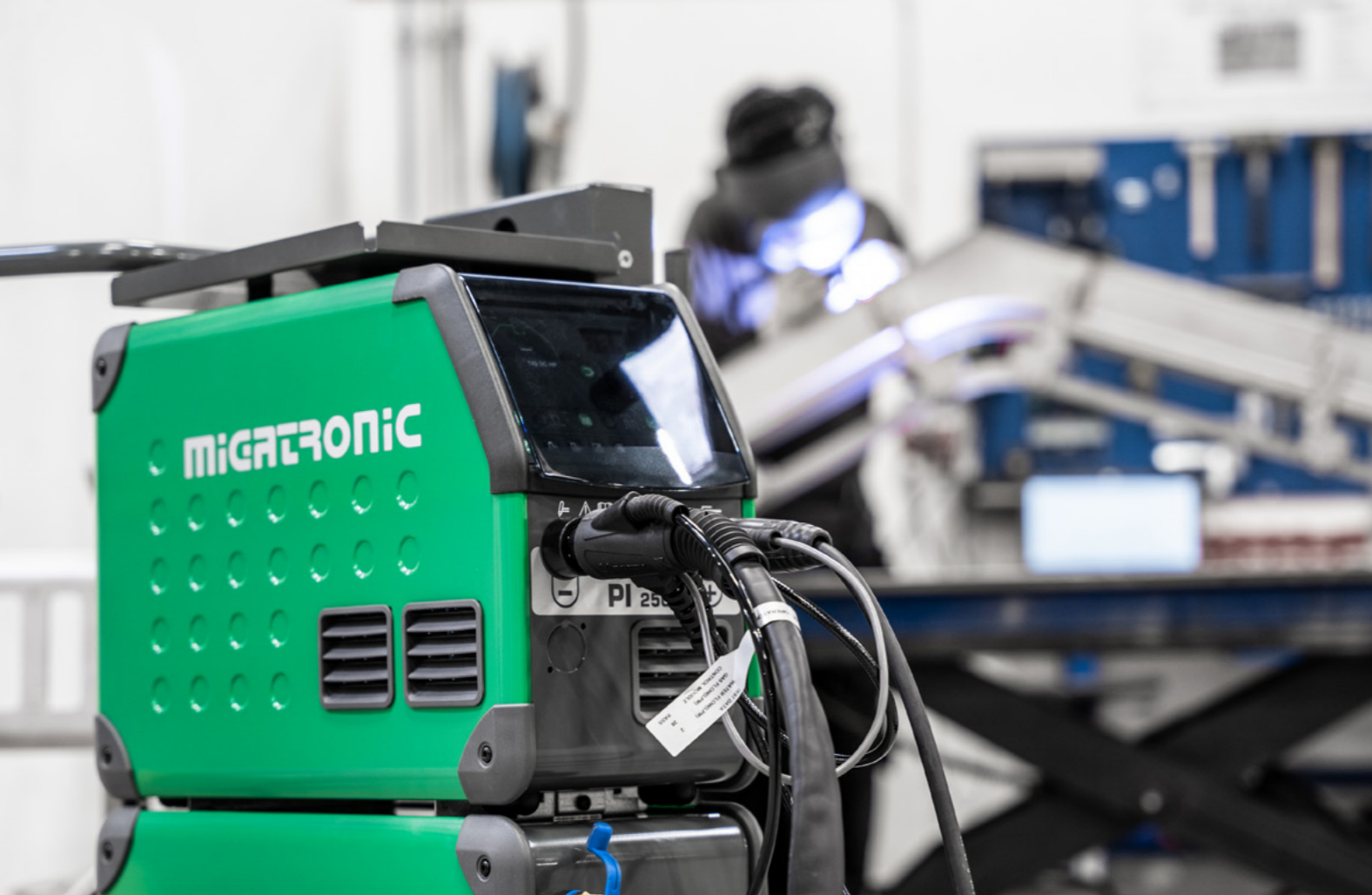
Pi 250 A